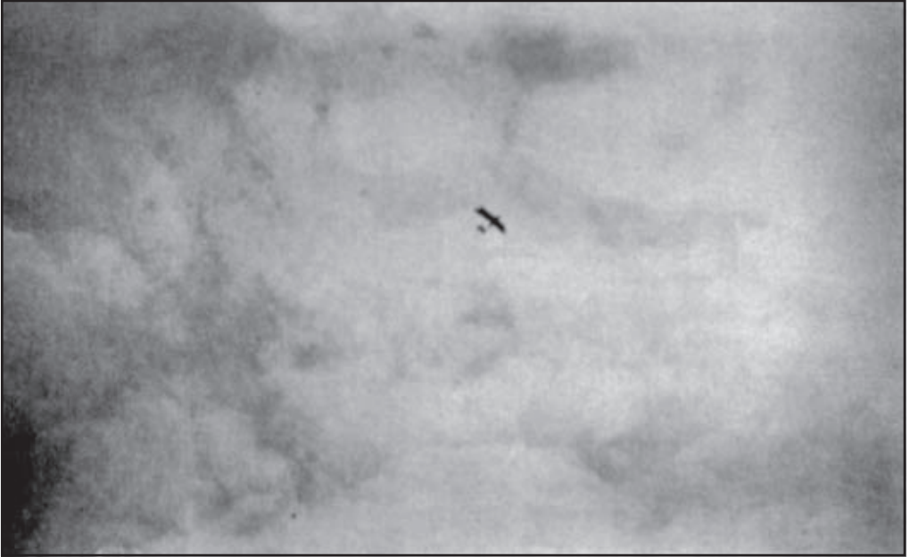
Ty Cobb at the zenith of his career. A rare and hitherto unpublished photograph of the famous player's flight in an aeroplane

ion, and, in short, to show that they were extremely independent organizations. There was, of course, the annual guff about the American League's being dissatisfied with the makeup of the National Commission, and tired of a governing body that had two National Leaguers on its membership. That stuff is sprang each and every winter, but this time the squawk was louder than usual, and Ban Johnson was quoted by several newspapers as expressing marked objections to the governing conditions. This much may be noted, too: The two leagues no longer hold their meetings in the same city and at the same time, and the schedule meetings of the two outfits were pulled a week apart, the National League convening in New York, the American League meeting subsequently—nominally in New York also, but actually after everything had been cut and dried in Chicago. Ban Johnson, too, be it noted, sulked in his tent and didn't attend the great dinner given in New York in honor of the National League's fortieth birthday. All of these things seem to show that the two major leagues have reached the parting of the ways; that they won't start any trouble with each other, but that henceforward they will treat each