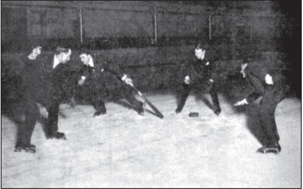
A new phase of the skating obsession which seems to have seized upon the nation. Ice baseball as seen at the St. Nicholas rink, New York